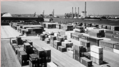
RCC's high strength stands up to heavy loads and special equipment at port and intermodal facilities

Curing ensures a strong and durable pavement. As with any type of concrete, curing makes moisture available for hydration—the chemical